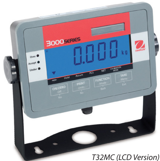
T32MC (LCD Version)