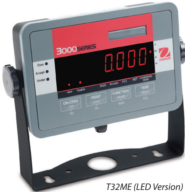
T32ME (LED Version)